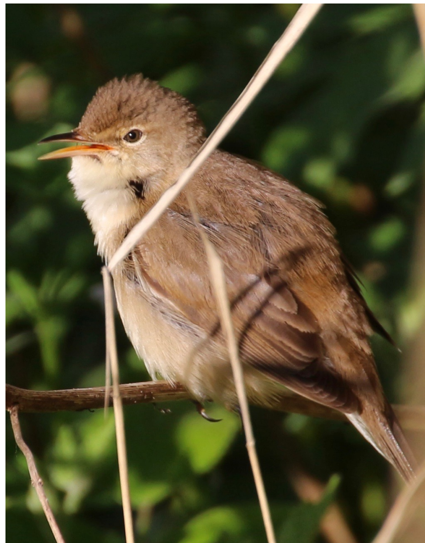
Reed Warbler at Ashburnham Place

Please send contributions for the July/August issue by Friday June 1st We reserve the right of refusal & the right to edit any articles