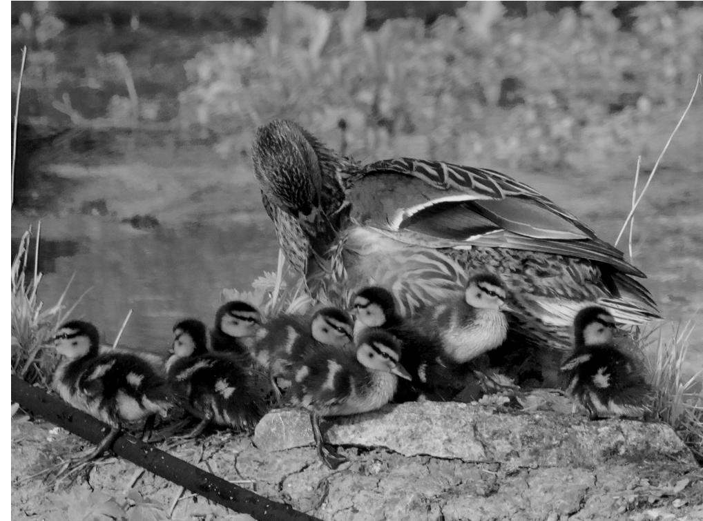
Mallard and Ducklings

Please send contributions for the May edition by Friday 5th April We reserve the right of refusal & the right to edit any articles