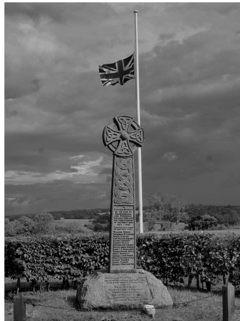
The flag at half mast following the death of Queen Elizabeth II

Please send contributions for the November edition by Friday 7th October. We reserve the right of refusal & the right to edit any articles