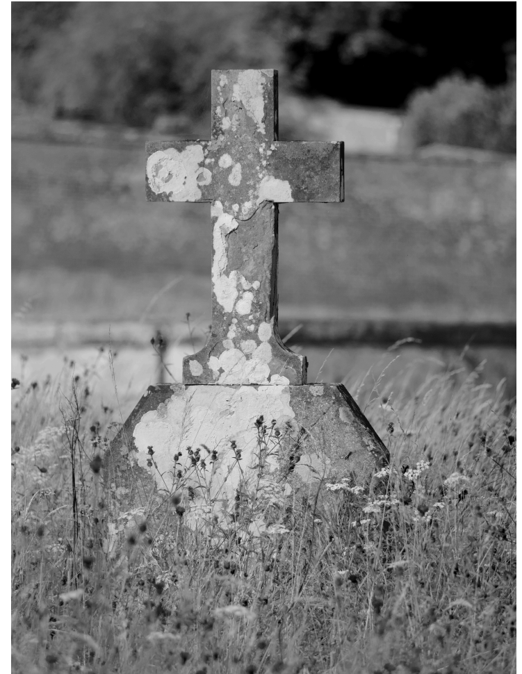
Photograph of a gravestone in Ashburnham Churchyard

The Churchyard is managed as a wildflower meadow and has many different species growing which support grasshoppers, crickets, butterflies, bees, moths and hoverflies.