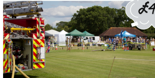
£2,200 to St Michael's Hospice and £2,200 for community projects on the Sports Field Site