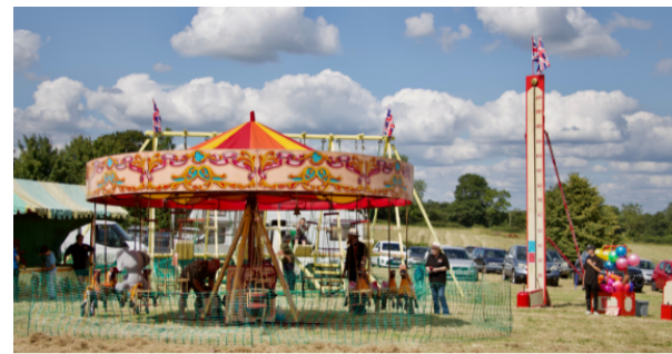
Ashburnham and Penhurst Flower Show and Country Fair 2024